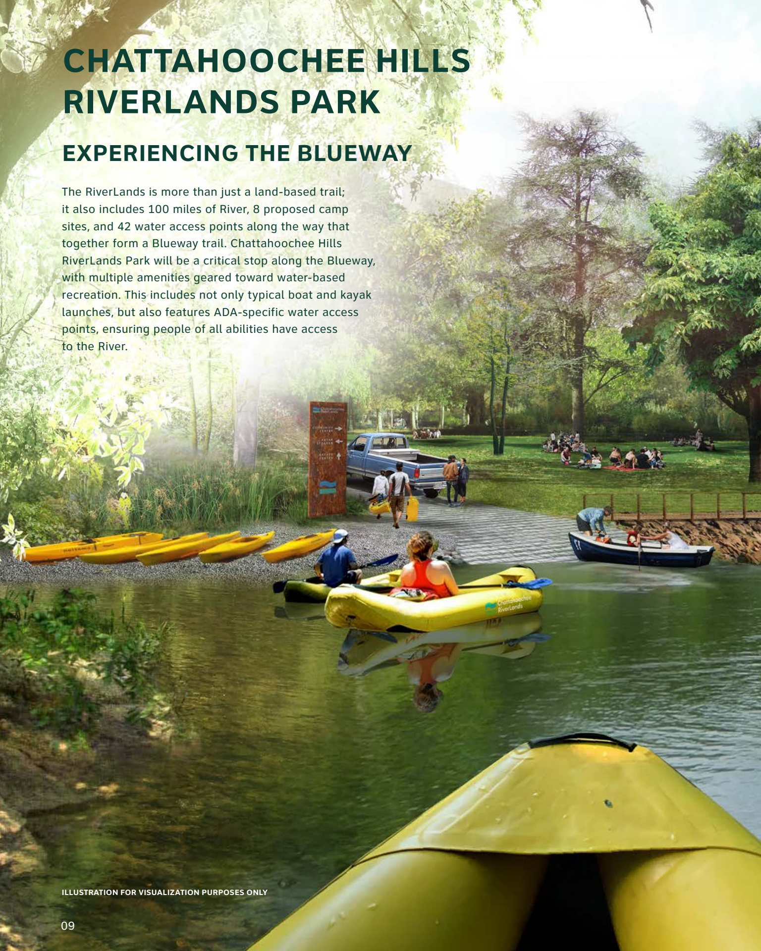
ILLUSTRATION FOR VISUALIZATION PURPOSES ONLY

The RiverLands is more than just a land-based trail; it also includes 100 miles of River, 8 proposed camp sites, and 42 water access points along the way that together form a Blueway trail. Chattahoochee Hills RiverLands Park will be a critical stop along the Blueway, with multiple amenities geared toward water-based recreation. This includes not only typical boat and kayak launches, but also features ADA-specific water access points, ensuring people of all abilities have access to the River.