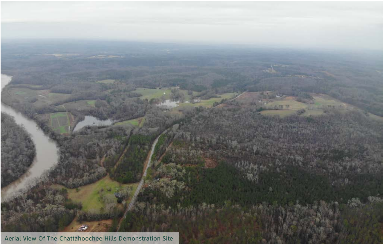
Aerial View Of The Chattahoochee Hills Demonstration Site